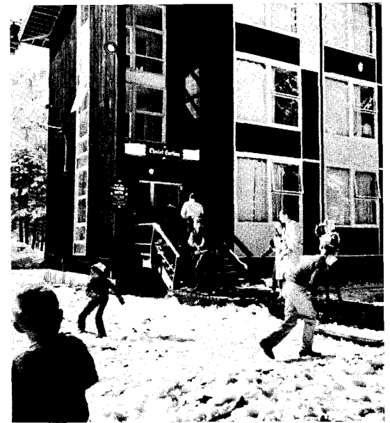
Children at play in Squaw Valley. God has provided His people with breath-taking scenery and lovely surroundings in which to enjoy His Festivals.

You need to figure the total number of miles you drive each year. Then figure what percentage of those miles