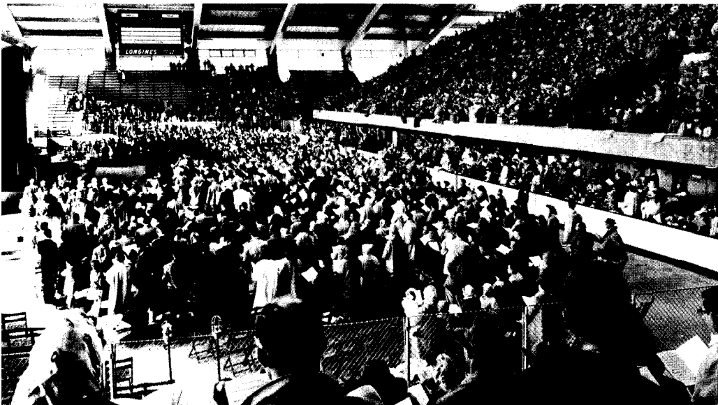
Services had just begun when this photograph was taken of the brethren singing a hymn at Squaw Valley.

Christ changed the priesthood from the physical tribe of Levi to the spiritual priesthood of Melchisedec (Heb. 7:12). The bulk of the seventh chapter of Hebrews is concerned with explaining the changing of the priesthood and the resultant change of those who were to receive the tithe.