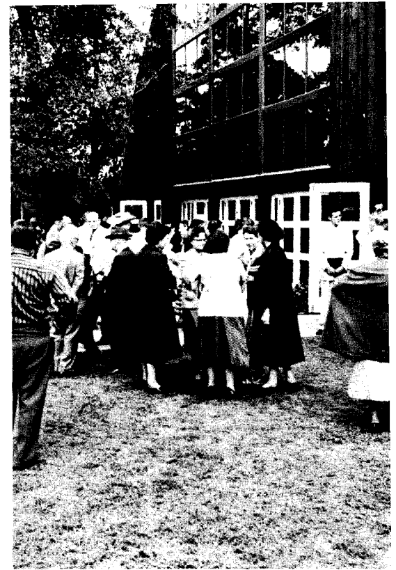
God's people relax in friendly conversation after lunch at the Tabernacle site in Big Sandy, Texas.

These problems have been solved and brought under control now. But they were brought about by the SELFISHNESS, GREED AND THOUGHTLESSNESS of God's People. Let's be sure it doesn't happen again. Be sure you are not guilty of mis-using your tithe.