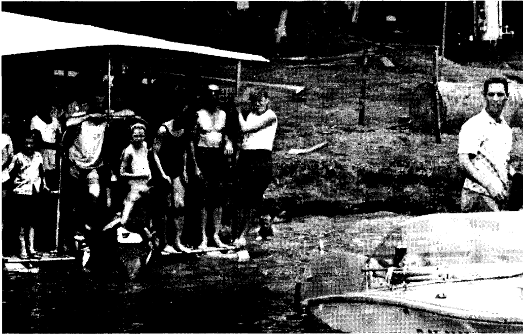
The Summer Educational Program in full swing! The children of many of God's People have the privilege to enjoy the time of their lives—as well as develop character this summer.

made a whirlwind trip to Europe to establish offices for the French Work.