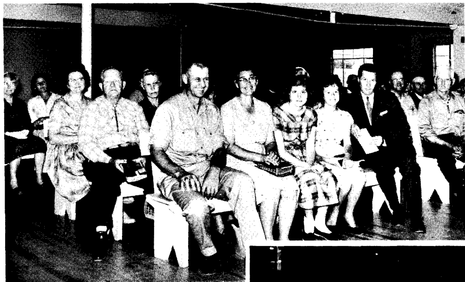
Upper Left: Newly established Bible study at Omaha, Nebraska. Center: Another Bible study recently begun at Rapid City, South Dakota. Lower Right: New church at Boise, Idaho.

"Looking back to our beginning in Kansas City two years ago we had 112