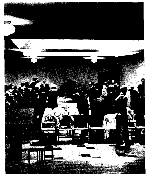
BELOW: A candid photo of the congregation at Vancouver. Services had been dismissed, but as in God's Church everywhere, the brethren were engaged in the pleasant fellowship every Sabbath affords.