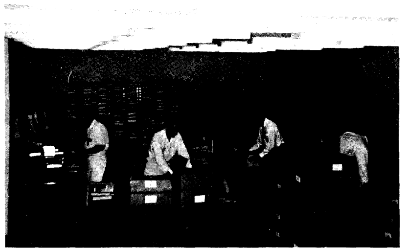
... quite a contrast with numbers and space involved in the current and expanding Canadian Work—twice doubled since it began!

mailing list has once again DOUBLED! Two more personnel have been added to the staff of office employees.