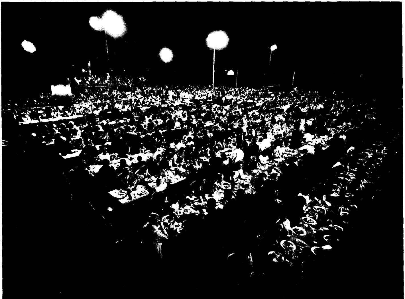
The delicious feast on the "Night to be Remembered" was enjoyed on the tennis courts of Ambassador College in Pasadena.

"We were blessed with splendid cooperation from all deacons, deaconesses,