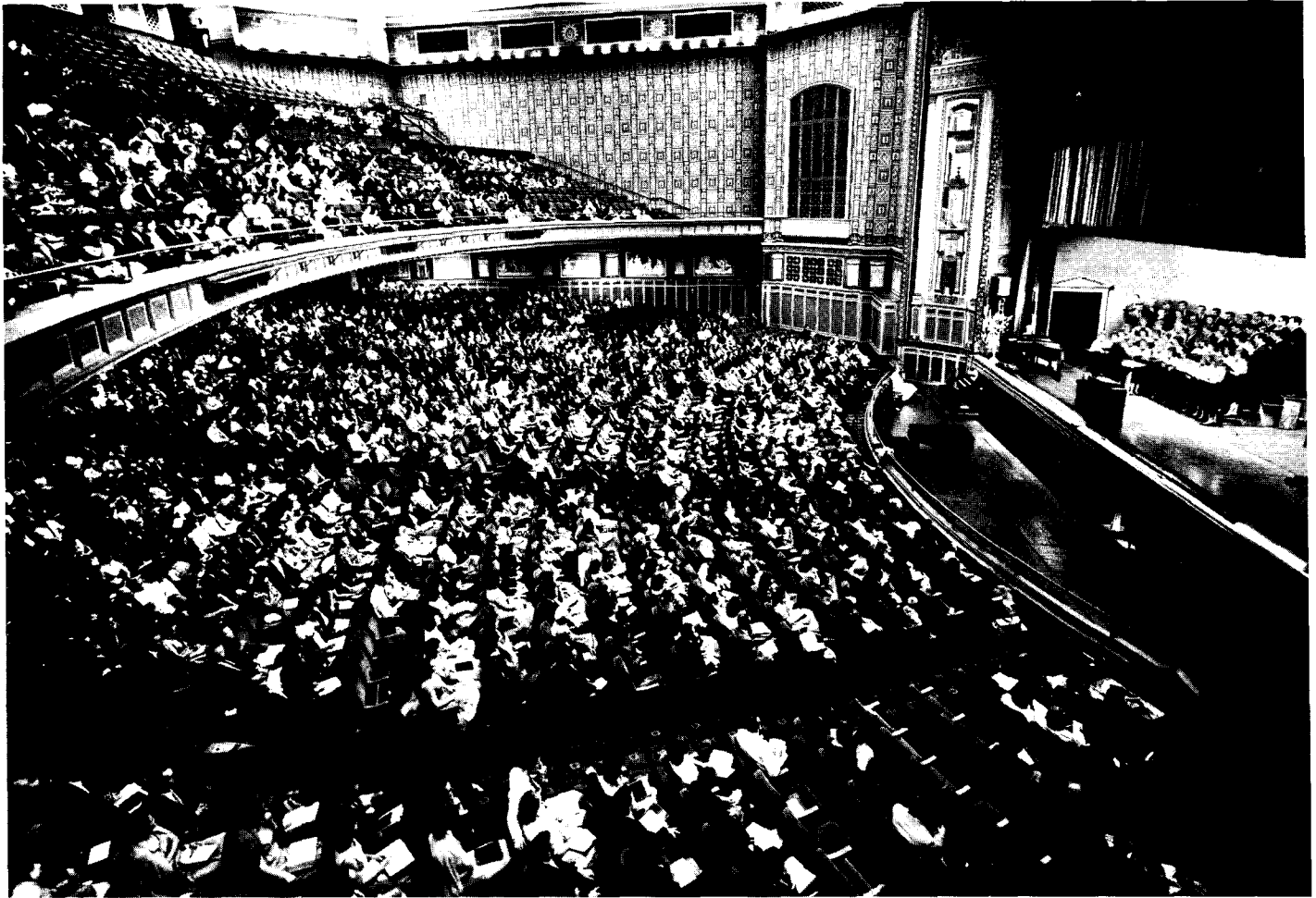
Over 2000 brethren assemble in beautiful Pasadena Civic Auditorium — with Ambassador Chorale on stage. This was on first Holy Day of the Feast of Unleavened Bread.