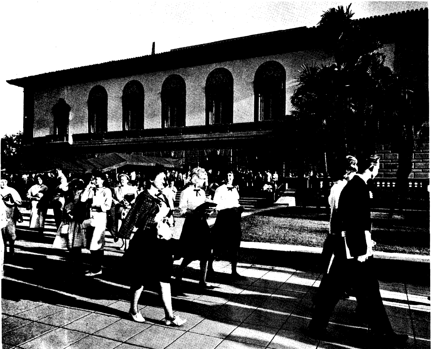
Outside view of the Civic Auditorium showing brethren and Ambassador students leaving one of the services.

brethren in attendance even on the weekly Sabbath to hear the sermons. Many had come in from Wisconsin, Minnesota, Iowa, Nebraska, Michigan, Indiana, Kentucky, and other outlying states to attend the entire Festival in Chicago.