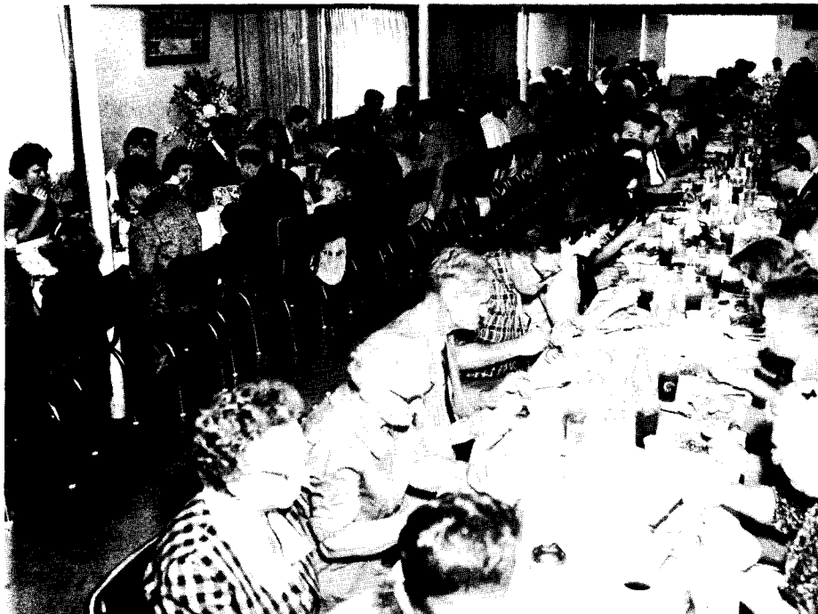
The brethren meeting in Opp enjoy one of their meals during the Feast.

"The National Guard Armory worked out splendidly. It was just like owning our own Tabernacle for the eight days. We had absolute privacy, use of the entire building, and were not disturbed by one intruder during the entire time. They say such is unusual in a commu-