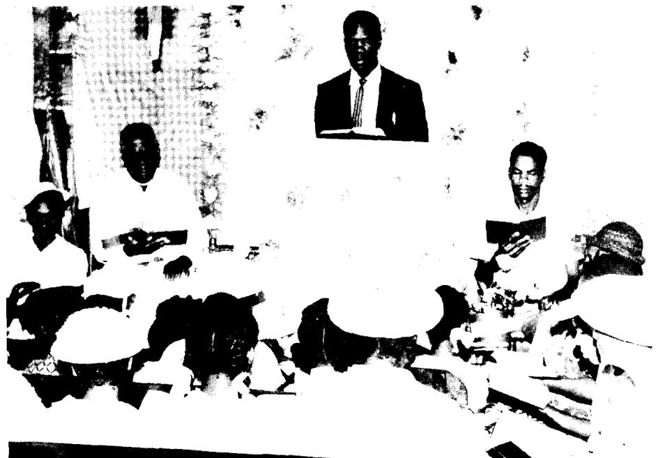
Notice the festive atmosphere in the Unleavened Bread service of our brethren in the West Indies.