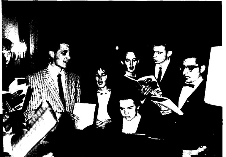
A time for singing—this spontaneous evening scene is representative of many a song session around the piano following a social occasion.