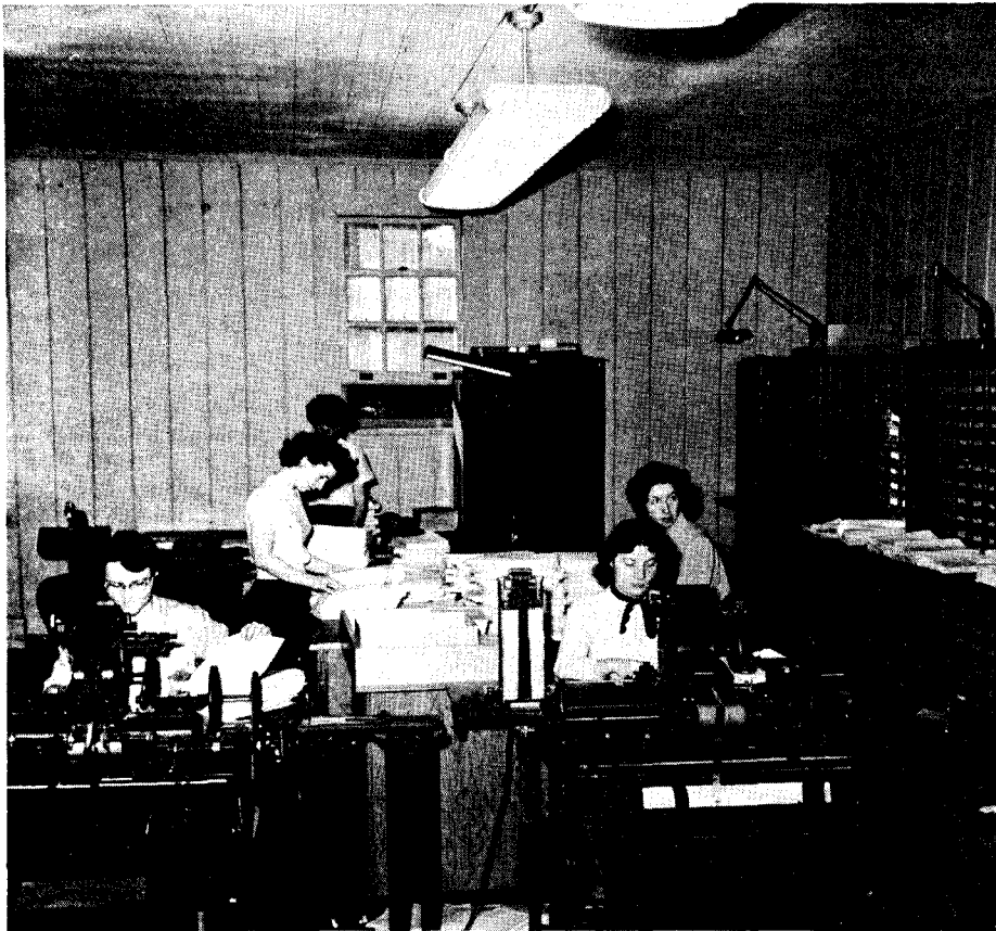
Ambassador College Press Mailing Department as it was in the years of 1948 through 1956.