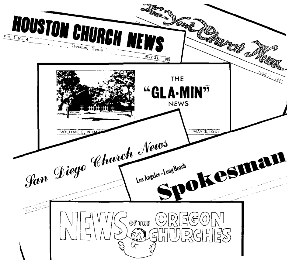
Mastheads of several of the local church papers.

The first newspaper on the stack is entitled "NEWS OF THE OREGON CHURCHES." You guessed it — it's partly illustrated by Mr. Basil Wolverton! Right under the headline is a little cartoon — drawn by Basil Wolverton — of a very interested reader with a newspaper in his hand, drawn so close to his face in profound interest that his nose has poked a hole through the paper! We find on the editorial staff of this Oregon