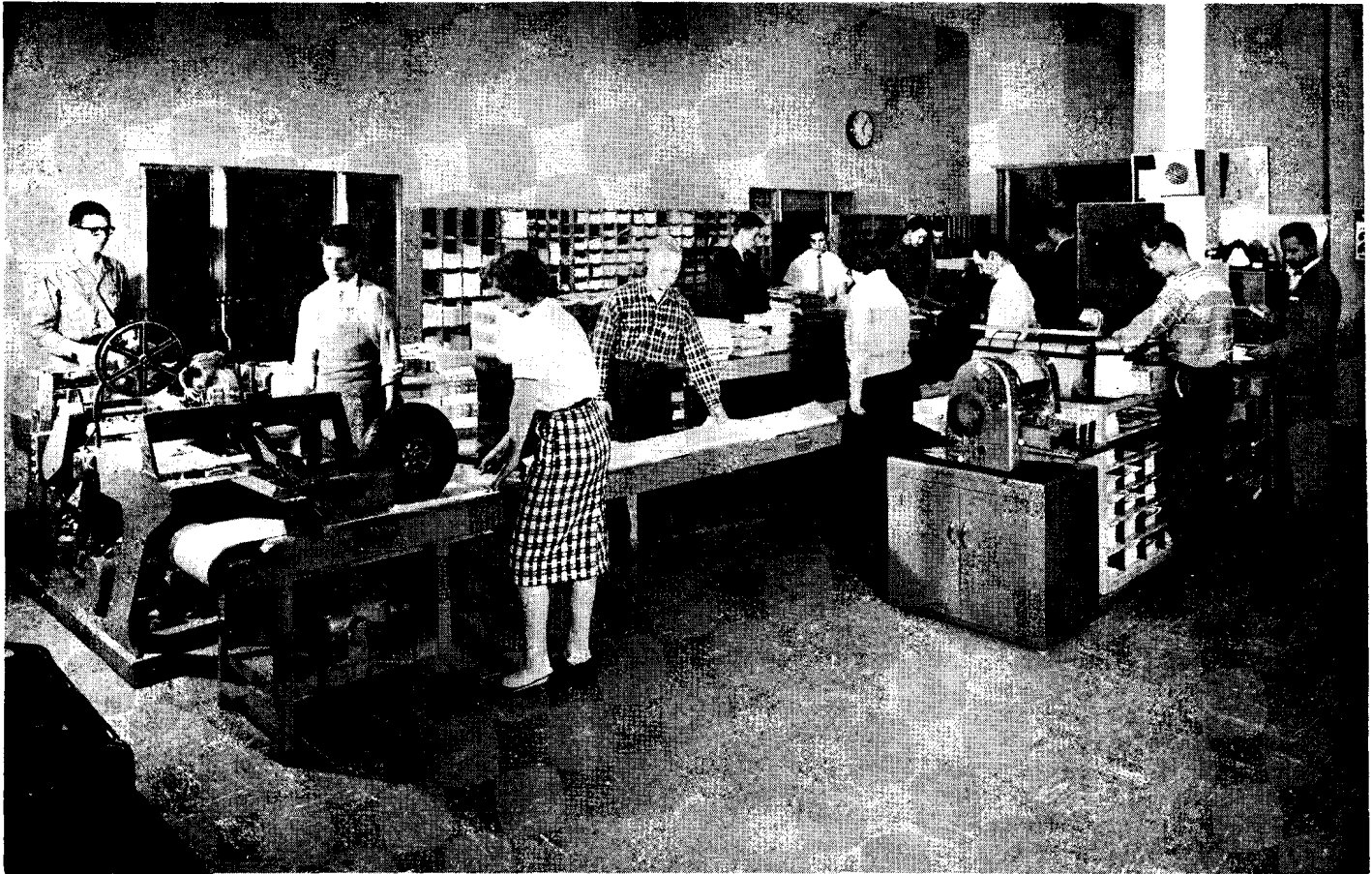
Ambassador College Press Mailing Department as it is today — 1961 — showing part of our new IBM electronic system.