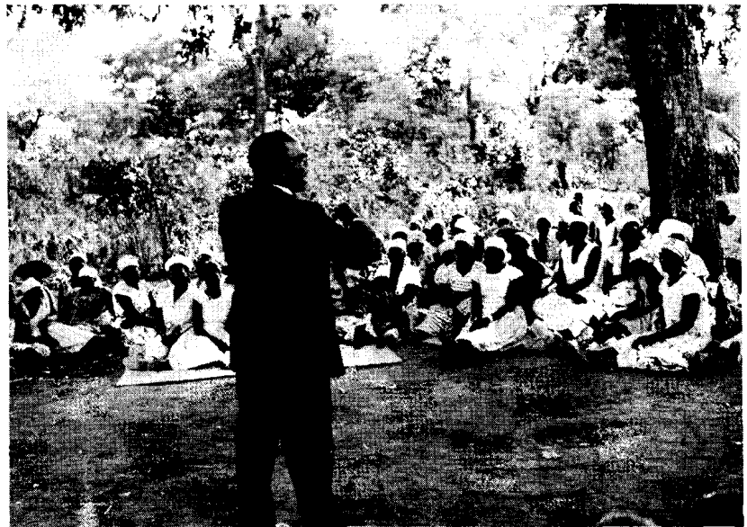
Service conducted at Kasenga's Village on May 7.