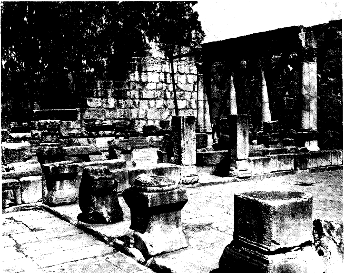
An inside view of the Capernaum synagogue. Though small, this was one of the largest synagogues in all Palestine.