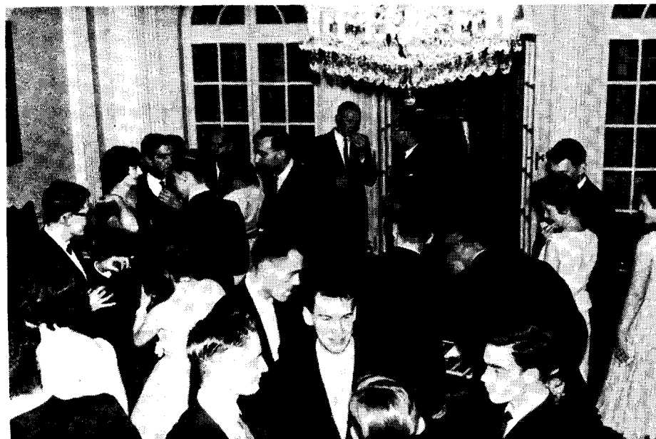
Looking onto the guests below in the Main Entrance Hall.

can tradition, and is utterly unique in the educational world, seeking and disseminating the true values of life—that we find these things practical, rewarding, and vital in the building of fine character in young men and women.