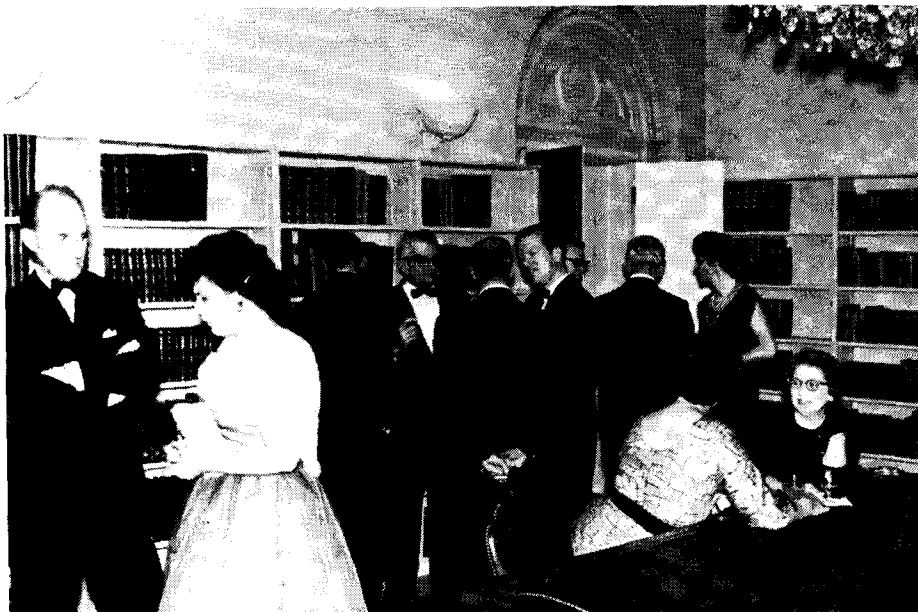
In the Library at the Faculty Reception, opening the first year of College in England.

English colleges may have large and ornate buildings, but they are bare and drab inside—just the plainest of furniture, usually two to six hundred years old—no color. One guest asked if I did not feel that these beautiful surroundings would be a deterrent to study and scholarship. British educators seem to have accepted a thread-worn tradition, which originated they know not when or where, that drab, unkempt, dreary