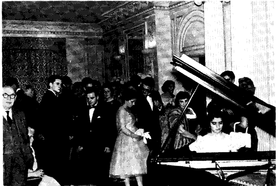
A candid view of the Faculty Reception at Ambassador in the United Kingdom.