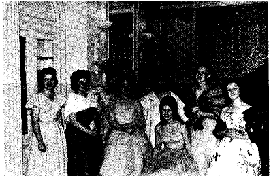
Some of our fine young ladies at Ambassador in England.