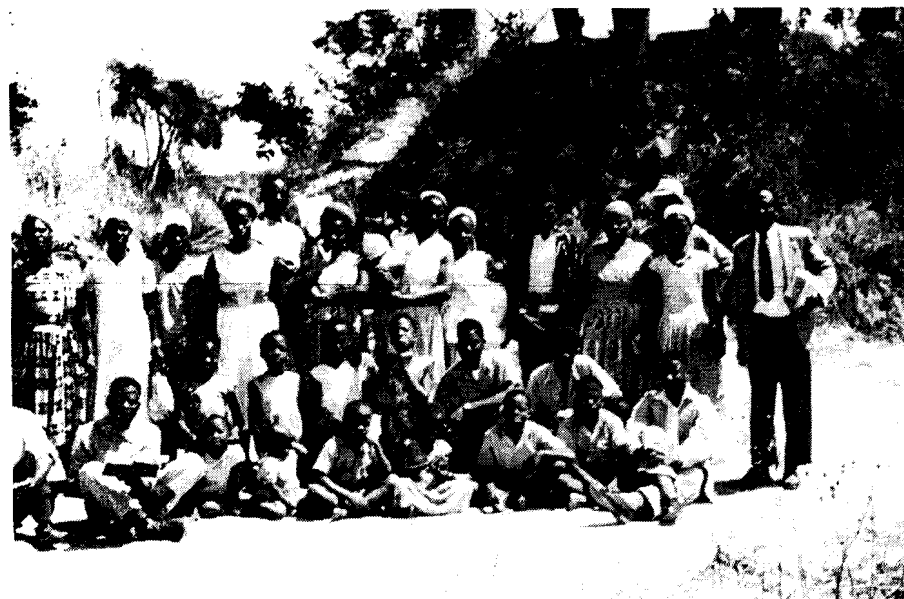
Left, the church members who attend the local congregation at Chimwemwe near Kitwe.

how you are going to attend the Feast of Tabernacles next year! Many hundreds did not attend who possibly COULD have. A staggering number who had attended the year before DID NOT attend this year!