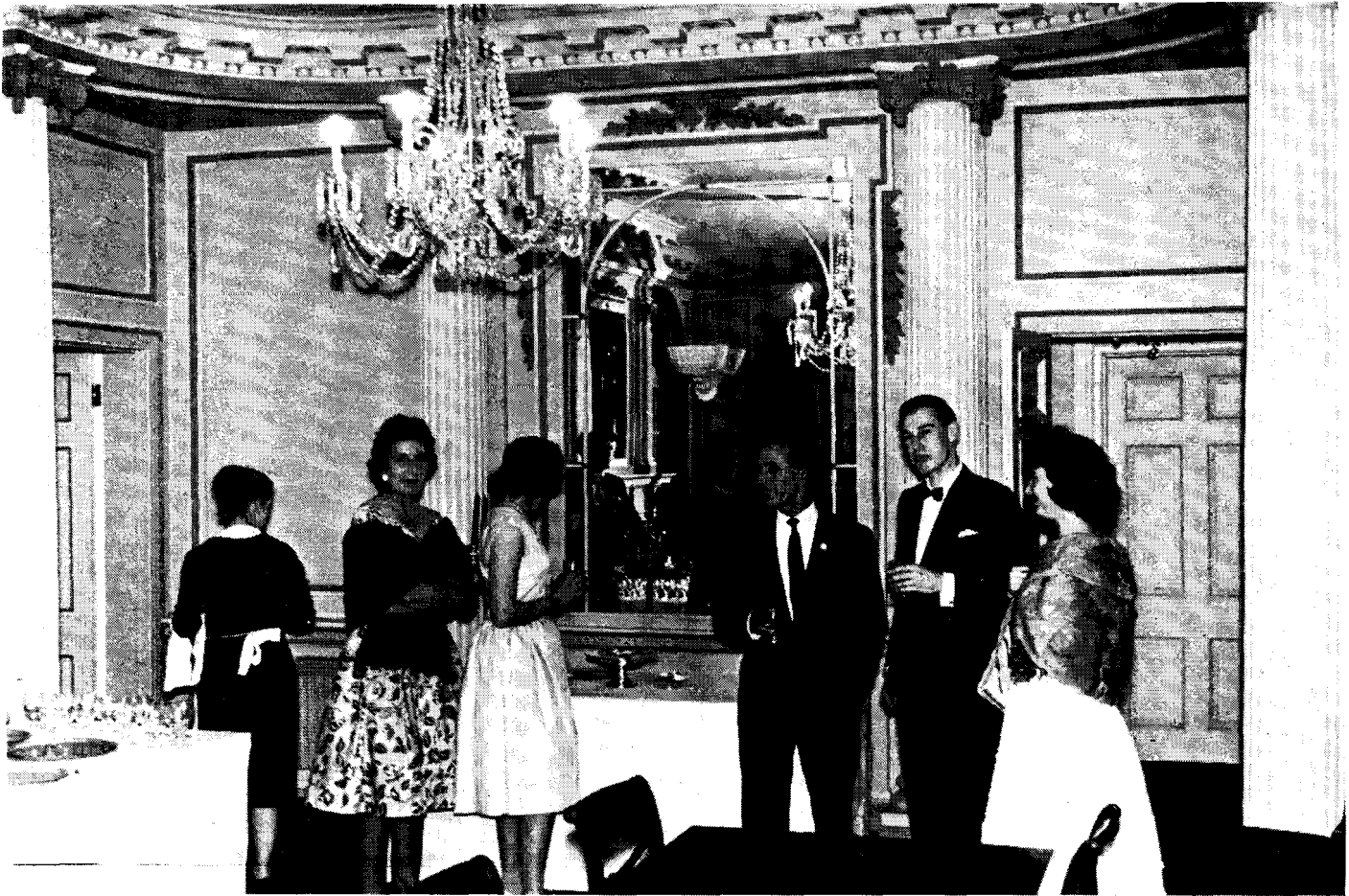
Enjoying a little punch at the Faculty Reception. Notice the gracious appointments of Ambassador's Memorial Hall.

vitaly needed ministers and other leaders for God's work here.