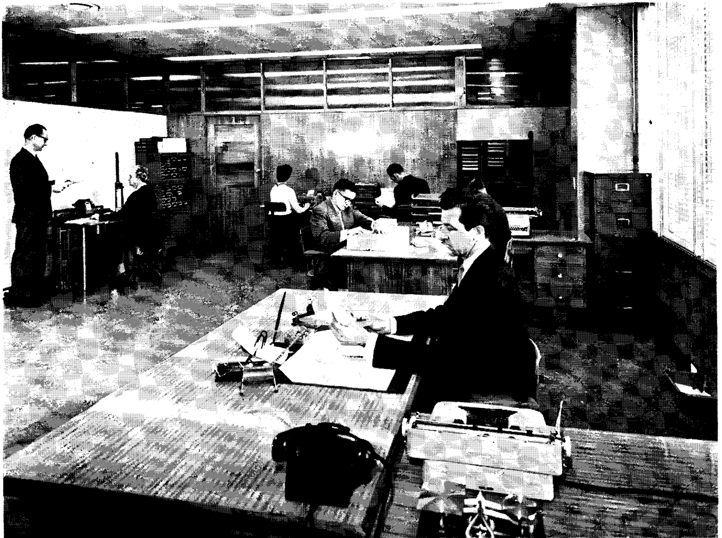
A partial view of the office staff at work in Sydney.

Australian visitors to the office see the far-flung stations which broadcast each night THE WORLD TOMORROW .