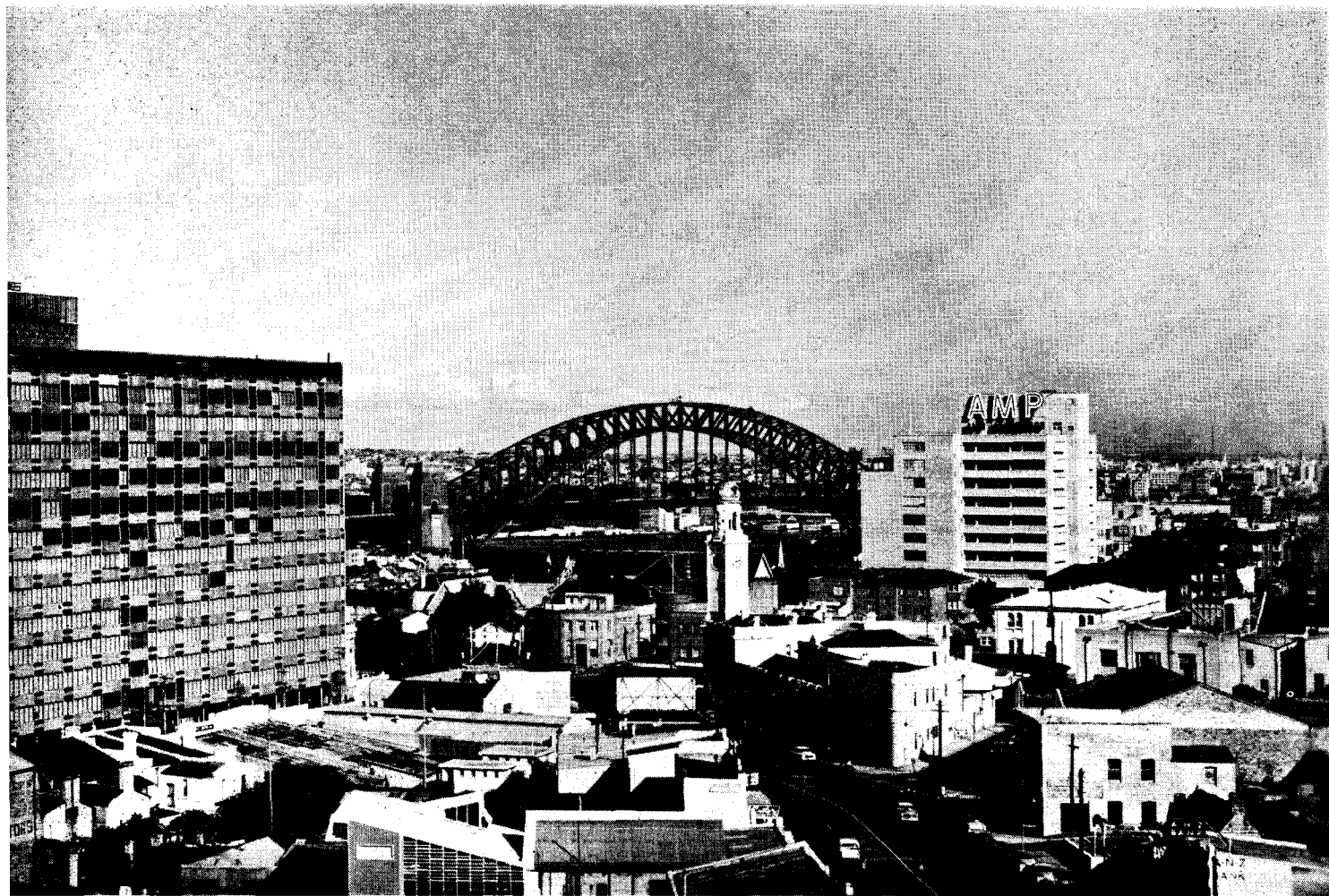
The ultra-modern "MLC" building, left, with famous old Sydney bridge in the background. Directly across the street from the building in which our new offices are located, and in the right center of the picture, is the small branch bank. Facing it, though not visible, is the North Sydney Post Office. The Radio Church of God offices in the "MLC" building look out over the sweeping expanse of beautiful Sydney Bay, and are located on the opposite side of the building.

ily after family. Eating was a delight this day for with each bite came a fellowship long to be remembered. Love and unity was strong and each enjoyed one another's conversation and presence. Seated on the grass, everyone was able to relax and just fellowship one with another and learn more about the bond between those jointly striving to enter into the kingdom of God.