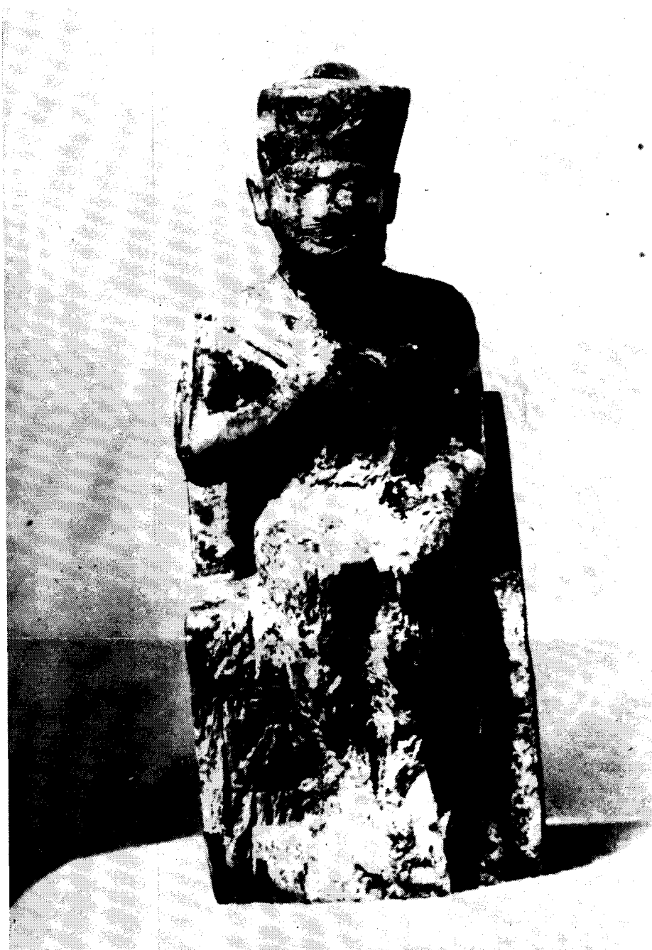
A badly damaged ivory statuette of Cheops from Abydos, Egypt. No other statues are known of him. The features of Cheops are distinctly non-Egyptian. Cheops built the great pyramid of Gizeh, near Cairo. It is the first and also the greatest pyramid ever built.

The Great Pyramid was built, according to Herodotus, over a period of about 20 years in the 3 months of each year during which the Nile overflowed and the people were idle. Its construc-