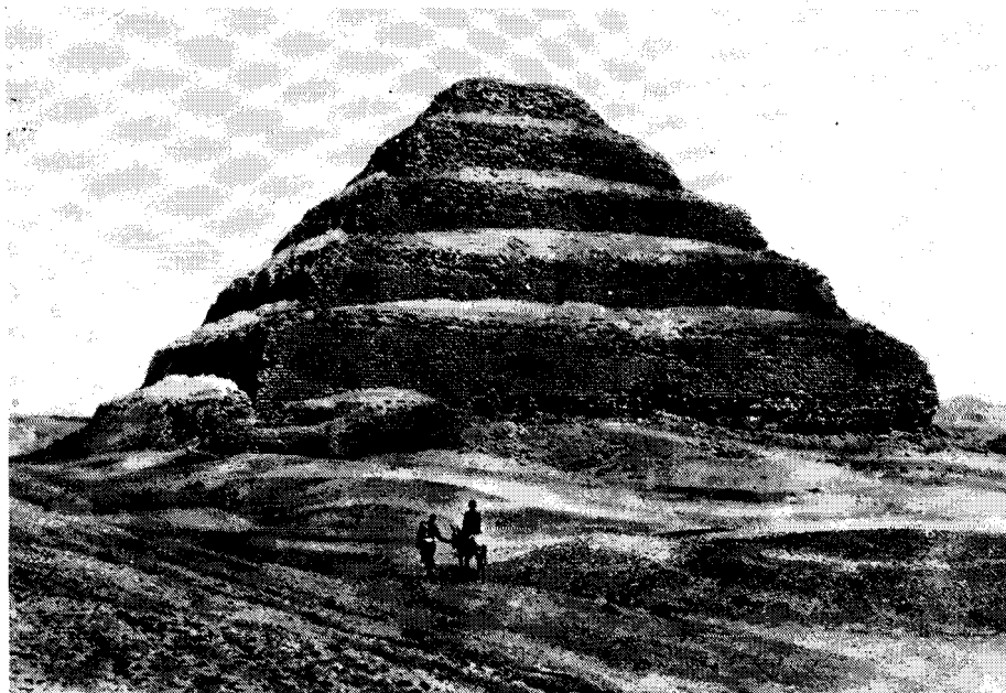
—Lehnert &amp; Landrock, Cairo

The Egyptians knew of the Creator in the days of Joseph! Not until nearly the days of Moses did gross idolatry