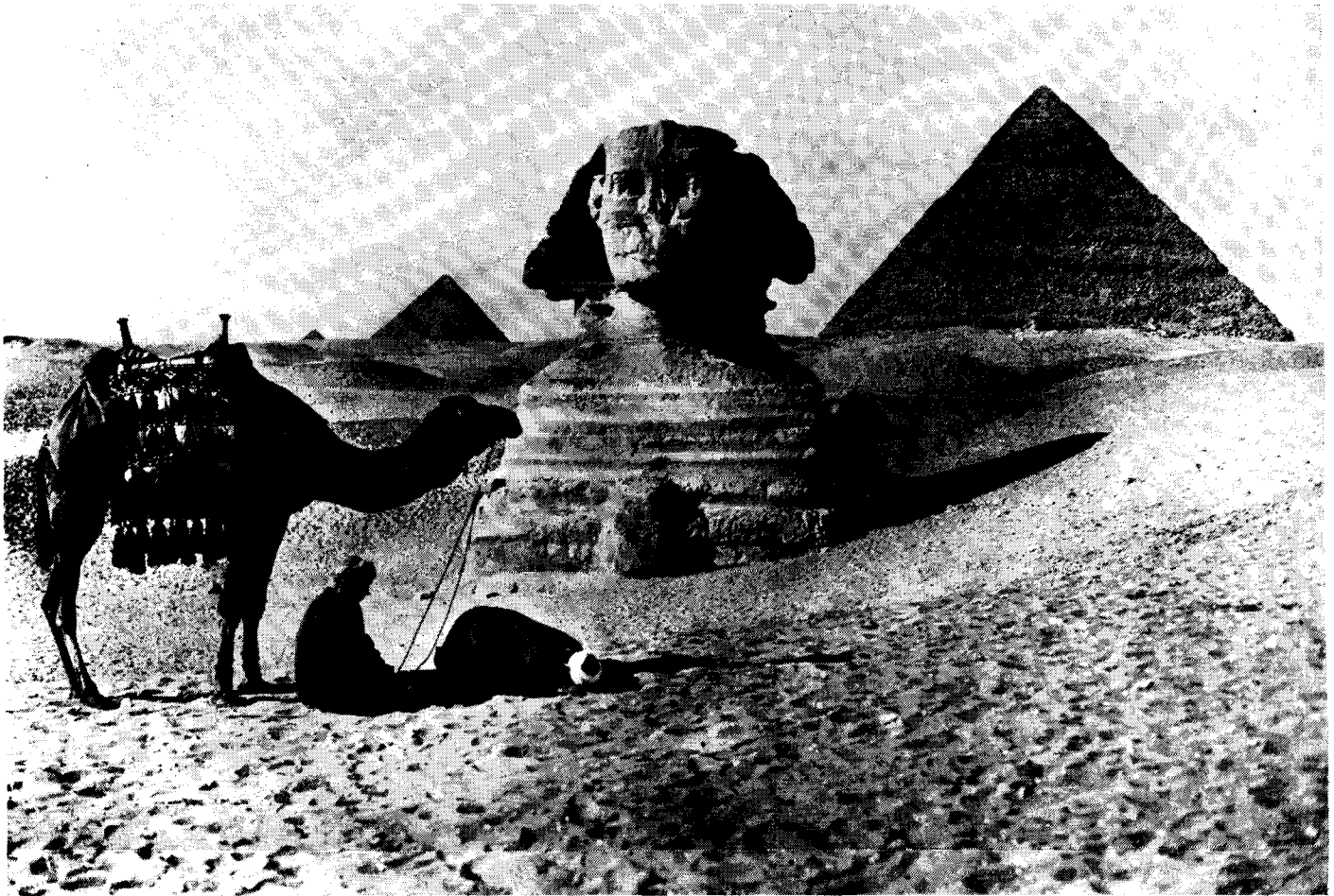
Arabs praying near the Great Sphinx before the sand was dug away from its base. The second largest pyramid is in the background to the right.

me men gave ear, and waited, and kept silence at my counsel. After my words they spake not again. . . . I . . . sat as chief, and dwelt as a KING in the army, as one that comforteth the mourners" (Job 29:21-25).