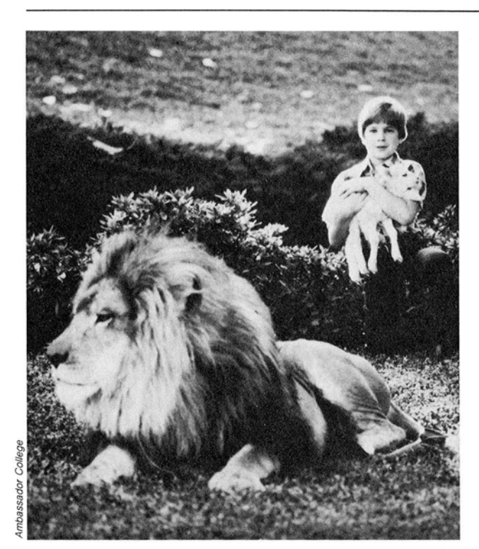
FORETASTE OF UTOPIA —The Feast of Tabernacles pictures the peaceful, happy World Tomorrow, when even the lion and lamb will dwell together in peace.

inspired. Most Bibles with marginal renderings show that the original word was azazel. Azazel among the early desert dwellers in the Sinai referred to Satan the devil!