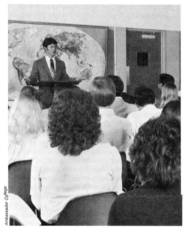
LEARNING TO RULE —The Christian life is like going to school to learn how to rule and teach.

Baptism and the laying on of hands of a minister of God for the receipt of the Holy Spirit also shows our recognition of, and submission to, the authority God has placed in the called and chosen ministers of His Church. And through the consequent begettal of God's Spirit, we become part of His govern-